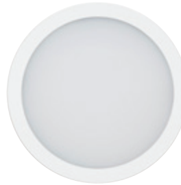
View from below