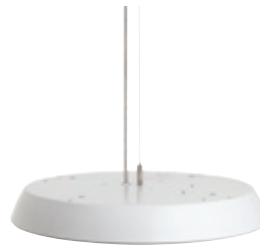
Top view without cover plate

For further information, contact our Technical Support and Application department on 01302 303240 or email LightingTechnicalUK@Eaton.com