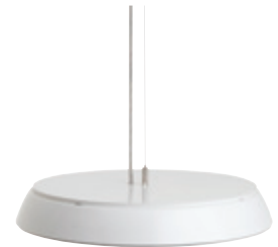
Top view with cover plate (PELBP)