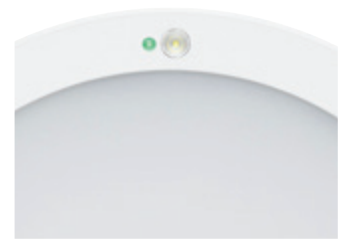
With integrated emergency module