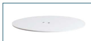
Back cover plate (PELBP)