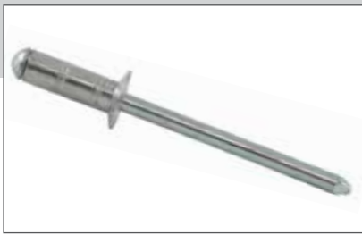
EN AW - 5052 [AlMg2,5]