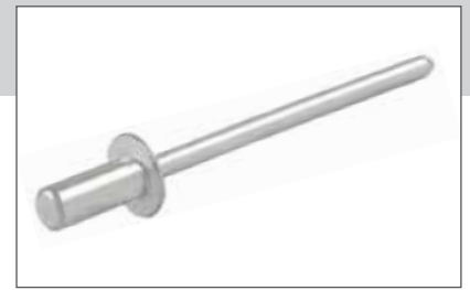
EN AW - 1050 A [Al 99,5]