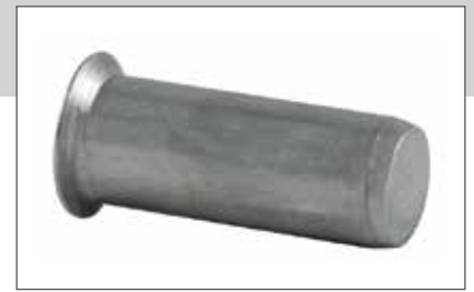
EN AW - 5754 [AlMg3]