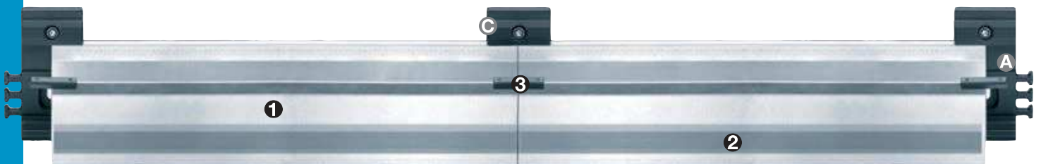
guidefast guide trough with glide bar, short trough bracket, standard-length from stock 2,000 mm