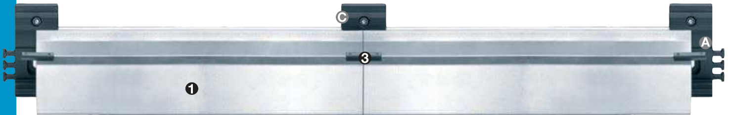
guidefast guide trough without glide bar, short trough bracket, standard-length from stock 2,000 mm