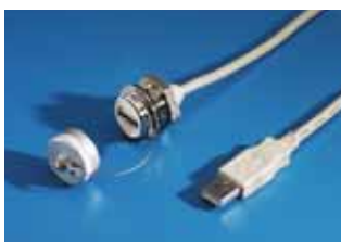
USB/RJ 45 extension Model No. see page 1150.