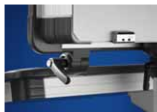
Frame connector, adjustable for Comfort Panel, Model No. see page 977.